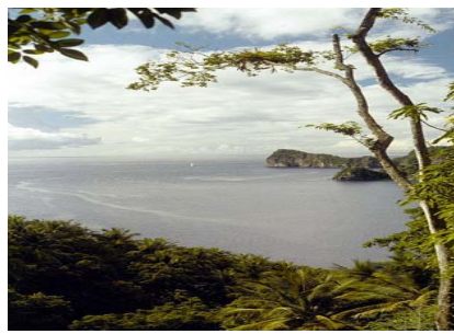
City to Surf

T he Sun-Herald annual city to surf was held on Sunday August 12, our practice was represented by a group of motivated patients eager to enjoy a great day of running. A record crowd of about 56,600 people participated in this year's event. Which